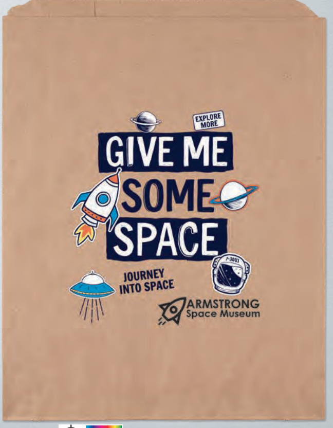
12 X 15